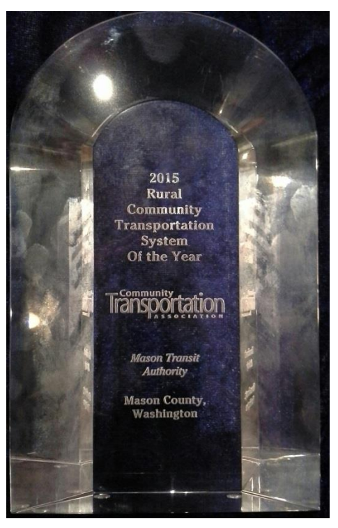
Pictured above: Crystal award trophy received by MTA from CTAA.

The Community Transportation Association of America, established in 1989, is a national non-profit, membership association committed to removing barriers to isolation and improving mobility for all people. CTAA provides informational resources, technical assistance, training and certification, and