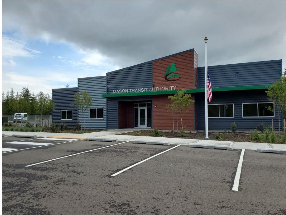
MTA's Belfair Park and Ride, 2022.